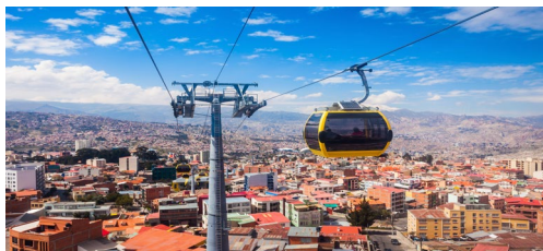
La Paz, Bolivia (Clinical Rotations)

APPLICATION OPEN: October 23 – Nov 27, 2023